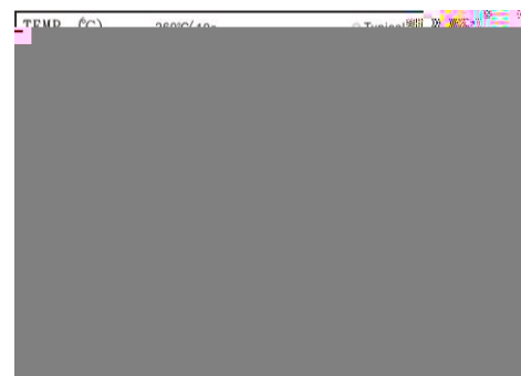
Wave Soldering (Flow Soldering)